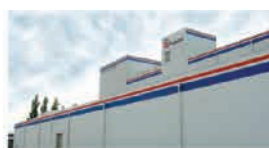
ANGEL Yeast (Chifeng) Co.,Ltd