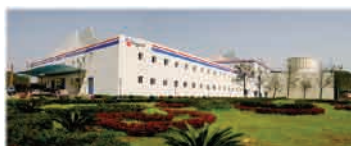
ANGEL Yeast Co.,Ltd