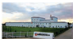
ANGEL Yeast (Yili) Co.,Ltd