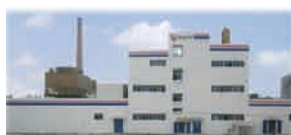
ANGEL Yeast (Suixian) Co.,Ltd