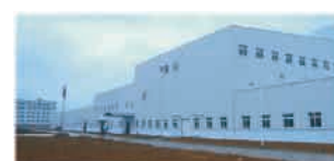
ANGEL Yeast (Chongzuo) Co.,Ltd